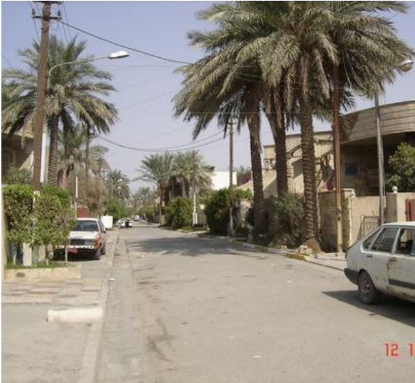
Figure (7) shows horizontal housing units and large areas compared to vertical housing.