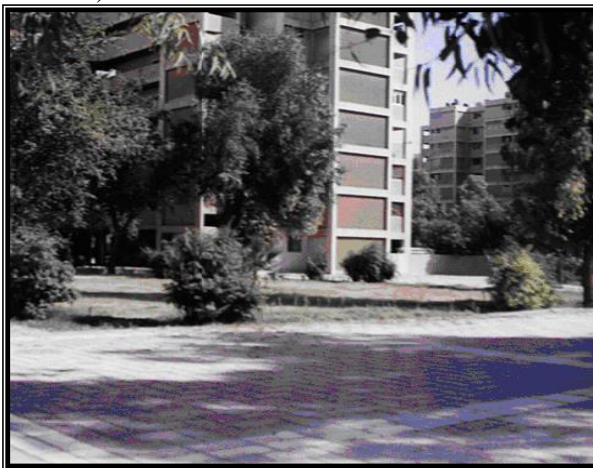
Figure (5): the interest in the cleanliness and openness of open spaces