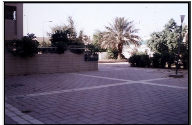
Fig. (3) No direct correlation of spaces with the outer perimeter (change in lines of movement with transitional spaces) as well as determination of ownership of open spaces behind residential buildings (fences)