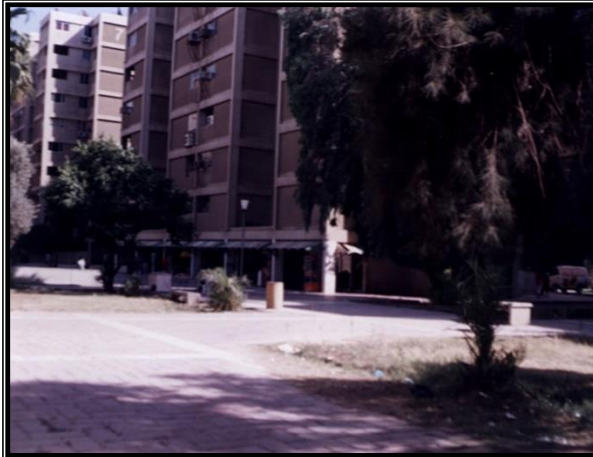
Fig. (4) Seats on some green places, note the neglect that has affected these parts (natural and artificial elements)