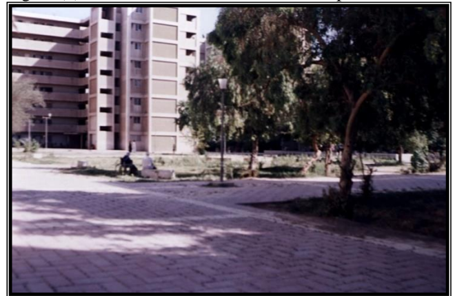
Figure (2): Attention to the ways of pedestrian traffic and cleanliness compared to the green spaces and their breadth